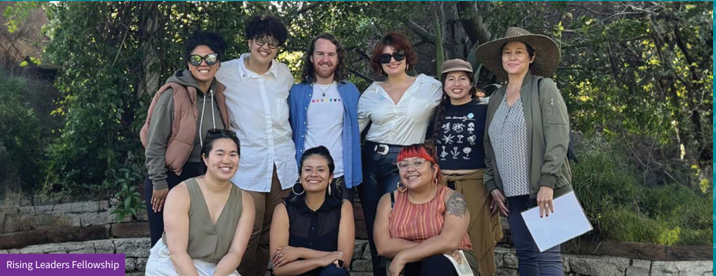
Rising Leaders Fellowship