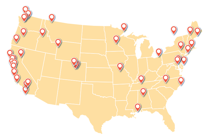
Figure 1. Map of Survey Participants

1. A survey of 51 organization leaders. These leaders (e.g., executive directors, directors of education) represented organizations from across the United States and Canada, with a heavier concentration in the western region (see Figure 1). Participants were