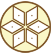
SUNRISE MIDDLE SCHOOL