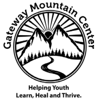
GATEWAY MOUNTAIN CENTER