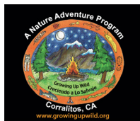
GROWING UP WILD