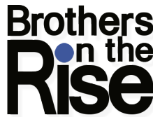
BROTHERS ON THE RISE