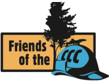
CALIFORNIA CONSERVATION CORPS